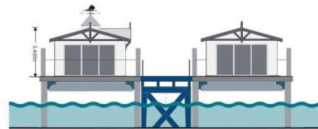
Back Elevation (South) from river – visitors centre left, workshop right 1:100