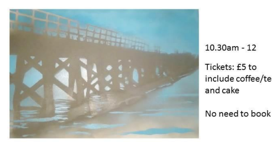
10.30am - 12 Tickets: £5 to include coffee/tea and cake